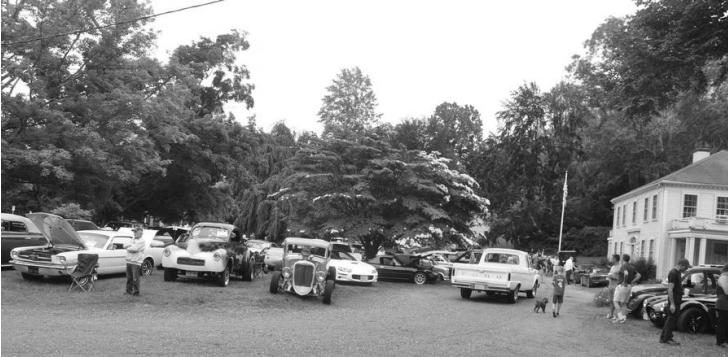
A view of the Car Show in 2017