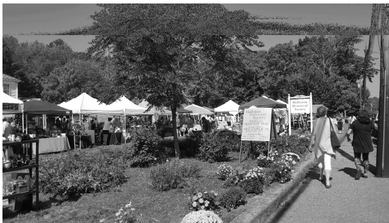
A view from the street of a past Harvest Fair and our gardens.